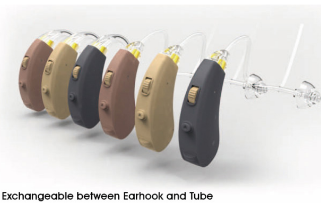
Exchangeable between Earhook and Tube

Designed with no screw make HDP a elegant smart digital BTE. Compact, flexible and highly effective, this is a great choice for mild to moderately severe hearing loss.